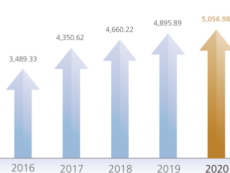
綜合總資產 CONSOLIDATED TOTAL ASSETS 億元港幣 HK$ (in Hundred Million)