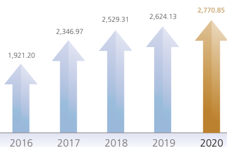
綜合各項貸款及其他賬項 CONSOLIDATED ADVANCES & OTHER ACCOUNTS 億元港幣 HK$ (in Hundred Million)