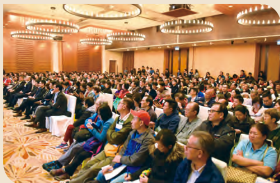
「名家投資講座 - 2019港股及灣區策略」 “Experts’ Experience Sharing Seminar - 2019 Investment Strategies for Hong Kong Stocks and Bay Area”

NCB has always highly valued healthy and consolidate relationship with customers. By hosting a variety of marketing activities, including seminars on investment and fund trading, NCB intends to provide customers with adequate access to professional knowledge and the latest market information on wealth management.