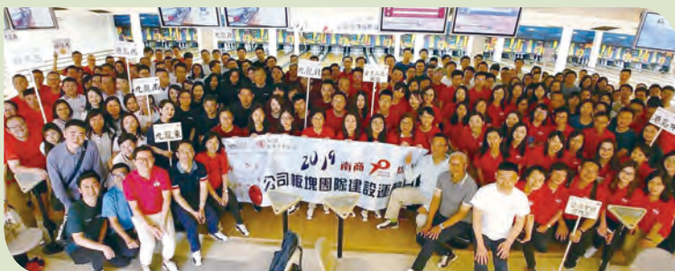
公司業務板塊團隊建設 Team building for different business segments of the Company