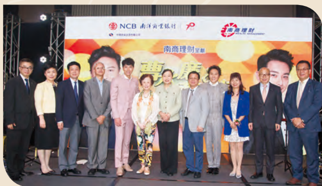
「南商理財」呈獻《曹永廉&蕭正南2019演唱會》 “NCB Wealth Management” presents “Raymond Cho & Edwin Siu 2019 Concert”