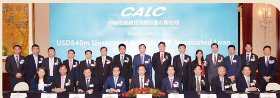
中國飛機租賃集團簽約儀式 “Signing Ceremony of China Aircraft Leasing Group”