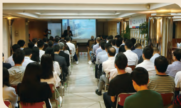
「內地房地產行業解析」分享會 Sharing Seminar on “Analysis on the Performance of Mainland Real Estate Sector”