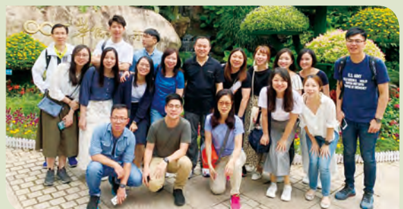
機構業務板塊團隊建設 Team building in business segments of the organization