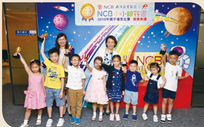
「小小銀行家填色」比賽 “Coloring Competition for Little Bankers”