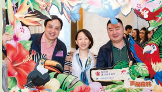
「中後台團隊建設培訓 – 跳躍森林」 “Team-building Programme for Middle and Back Office – Fun Searching in Forest”